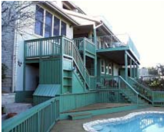
Dressing Room & Shower