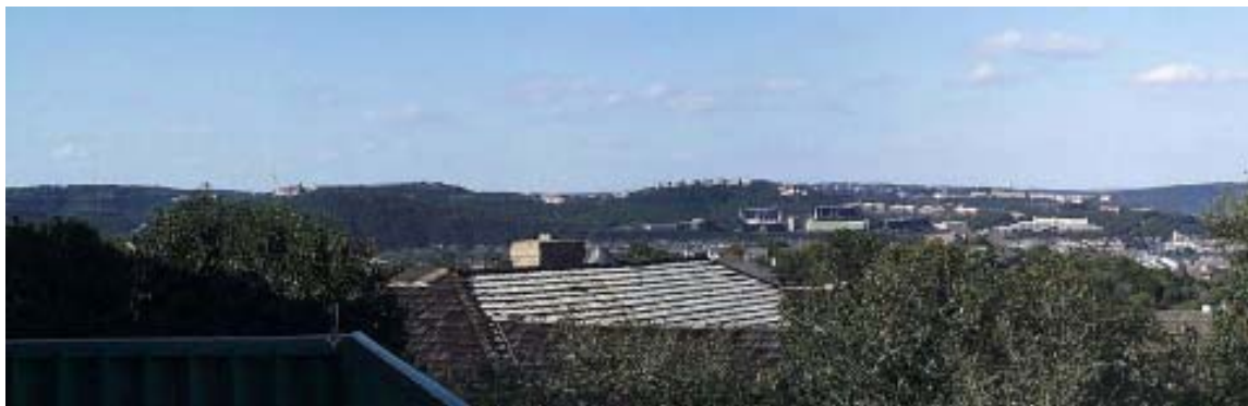
View From First Floor Deck

The information contained herein is furnished by the owner to the best of his knowledge, but is subject to verification by the purchaser, and agent assumes no responsibility for the correctness thereof. The sale offering is made subject to errors, omissions, change of price, prior sale or withdraw without notice. In accordance with the law, this property is offered without regard to race, creed, national origin or sex.