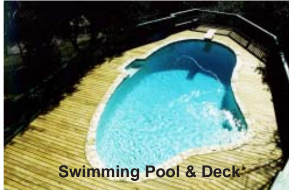
Swimming Pool & Deck