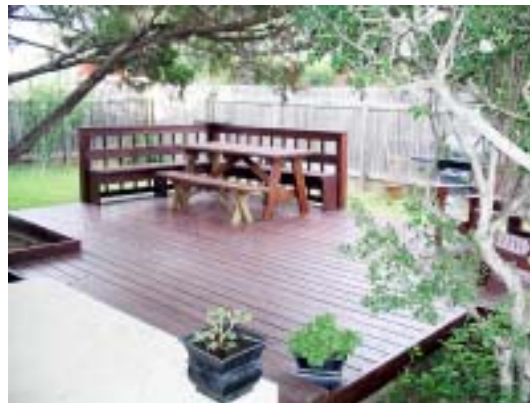
Back Yard Deck