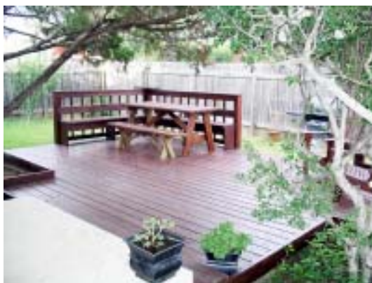
Back Yard Deck