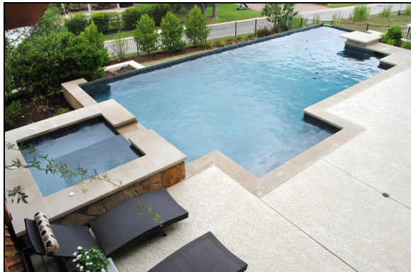
Swimming Pool & Spa