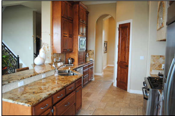
Kitchen with Stainless Steel Appliances