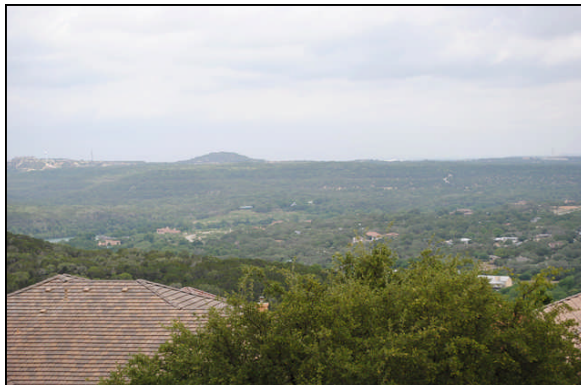
Hill Country View