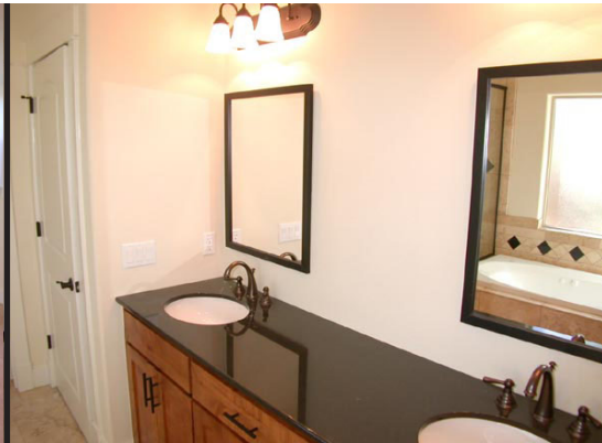
Master Suite Bath