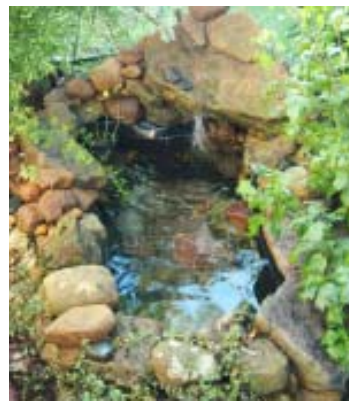
Pond in Back Yard