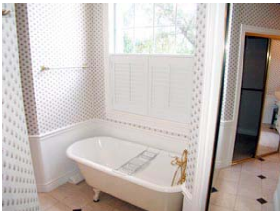
Master Bath Tub