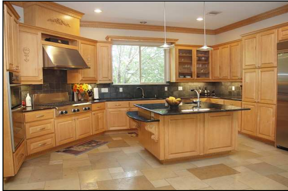
Kitchen with Stainless Steel Appliances