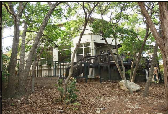
Rear View of Home