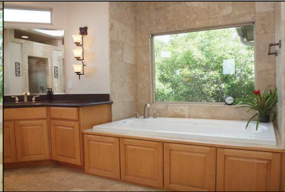
Master Suite Bath